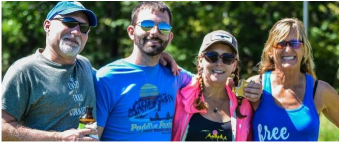
Mile 90 photo

HAWK aid stations are fully staffed, and serve Tailwind Nutrition, Water, Coke, Mountain Dew and Ginger Ale. We offer SaltStick caps, Honey Stinger gels, chews and waffles for additional electrolytes. Typical food includes but is not limited to oranges, bananas, watermelon, Pringles, pretzels, Oreos, Nutter Butters, M&Ms, peanut M&Ms, ginger chews, boiled potatoes, peanut butter wraps, Nutella wraps, and turkey wraps. We provide soups and other warm food during the overnight hours.